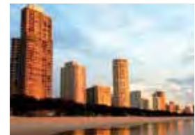
Gold Coast, Australia 28 – 31 October