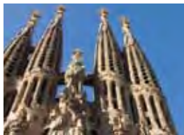
Barcelona, Spain 11 – 14 November