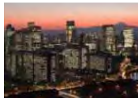
Tokyo, Japan 16 – 18 October