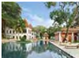
Goa, India 21 – 23 October