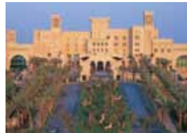
Dubai, UAE 5 – 7 March New location!

Thank you for your feedback, and we look forward to seeing you again next year at a global Gartner Symposium/ITxpo 2013 event: