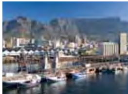
Cape Town, South Africa 16 – 18 September