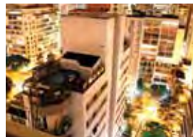
São Paulo, Brazil 4 – 6 November