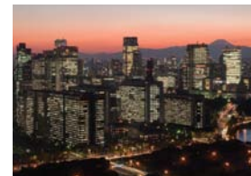
Tokyo, Japan 16 – 18 October 2013