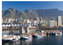
Cape Town, South Africa 16 – 18 September 2013

“This event caused a paradigm shift in running IT for both operation and future strategy. A must-attend for CIOs and IT executives.”