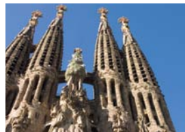
Barcelona, Spain 11 – 14 November 2013