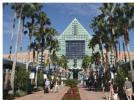
Orlando, Florida 6 – 10 October 2013