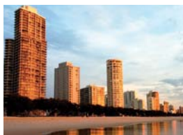
Gold Coast, Australia 28 – 31 October 2013