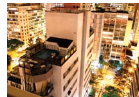
São Paulo, Brazil 4 – 6 November 2013