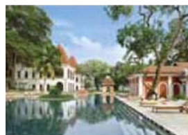
Goa, India 21 – 23 October 2013